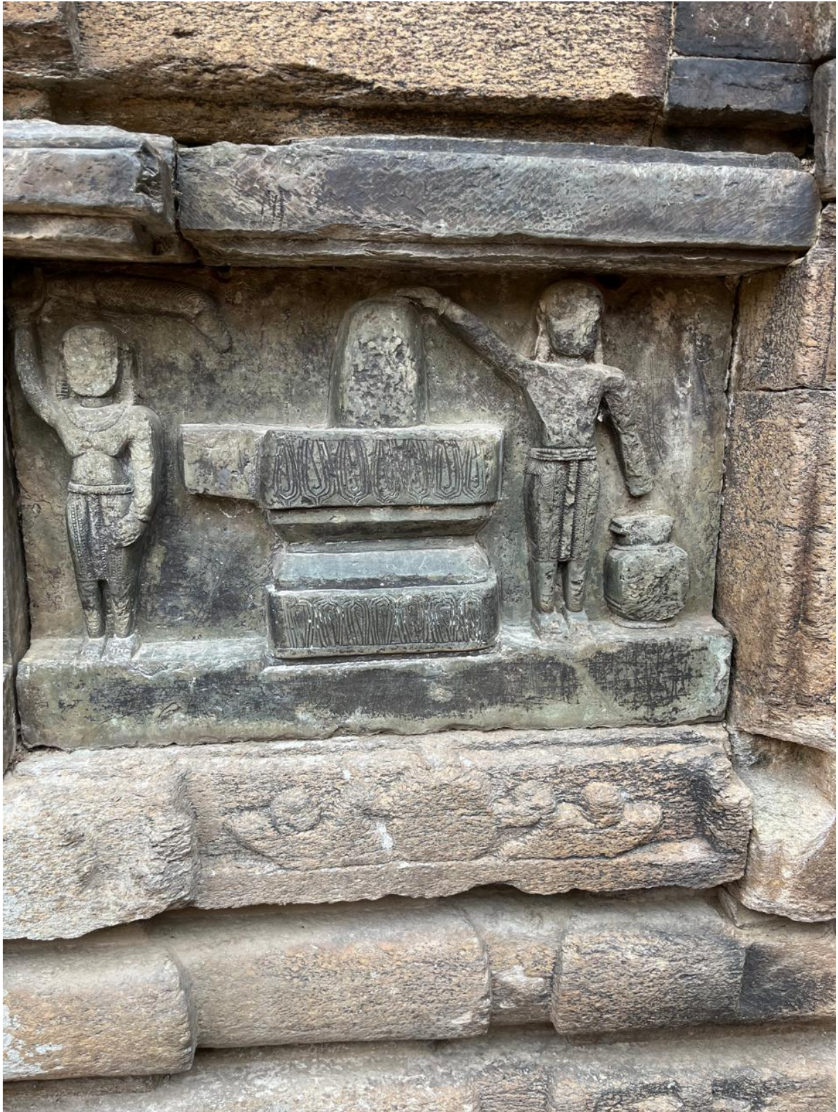
Different Iconographies at Naula