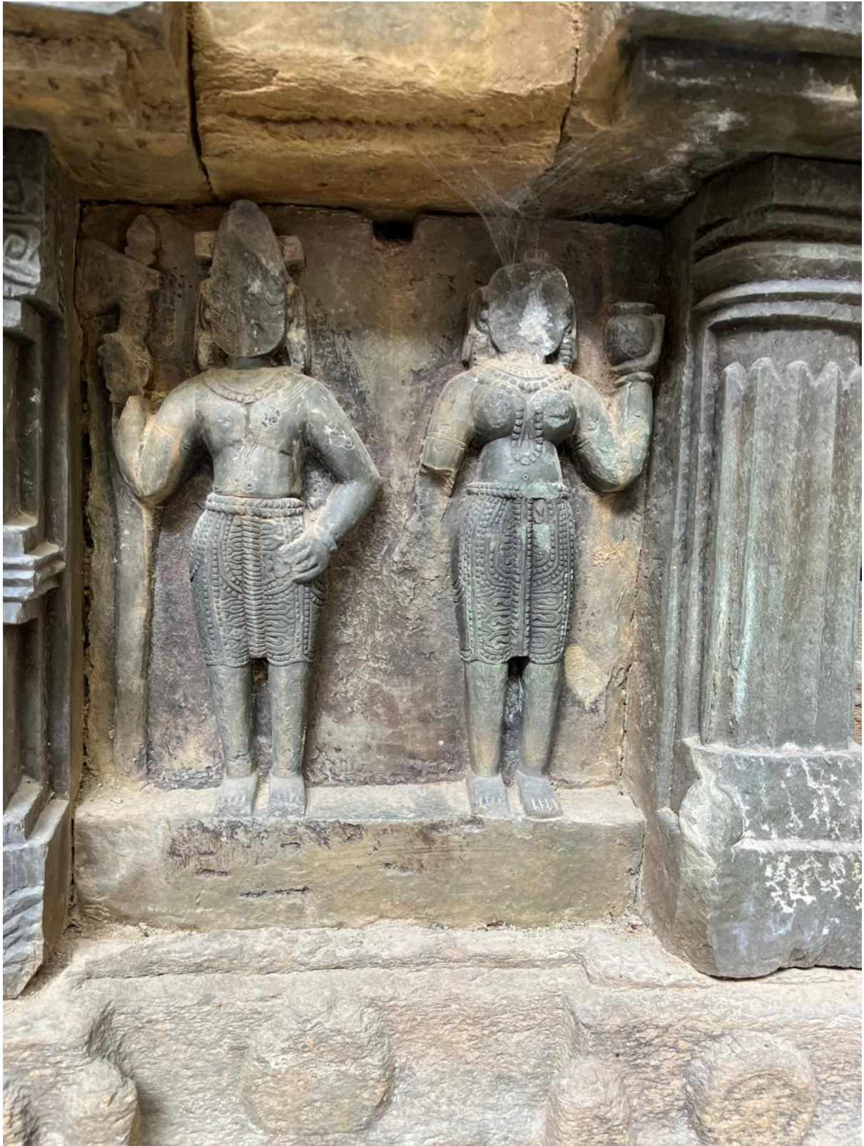
Different Iconographies at Naula