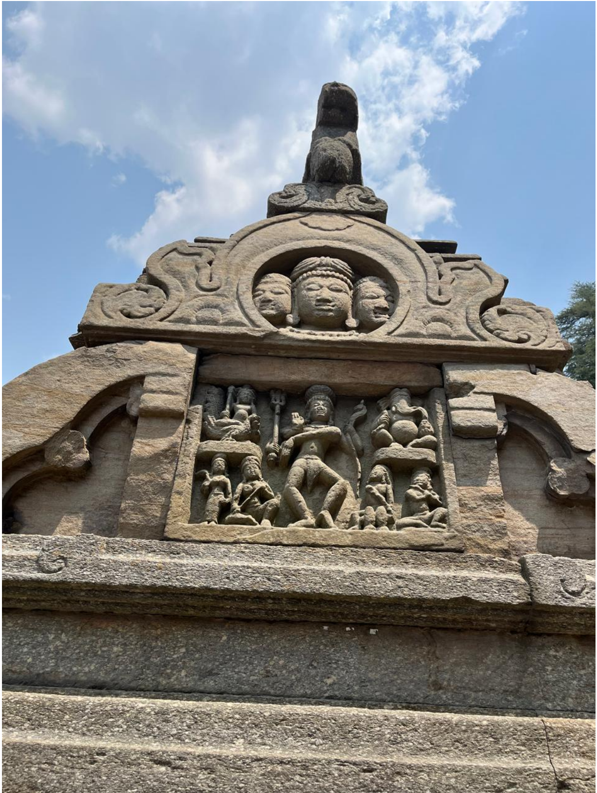
Iconographies at the walls of Jageswar group of temple