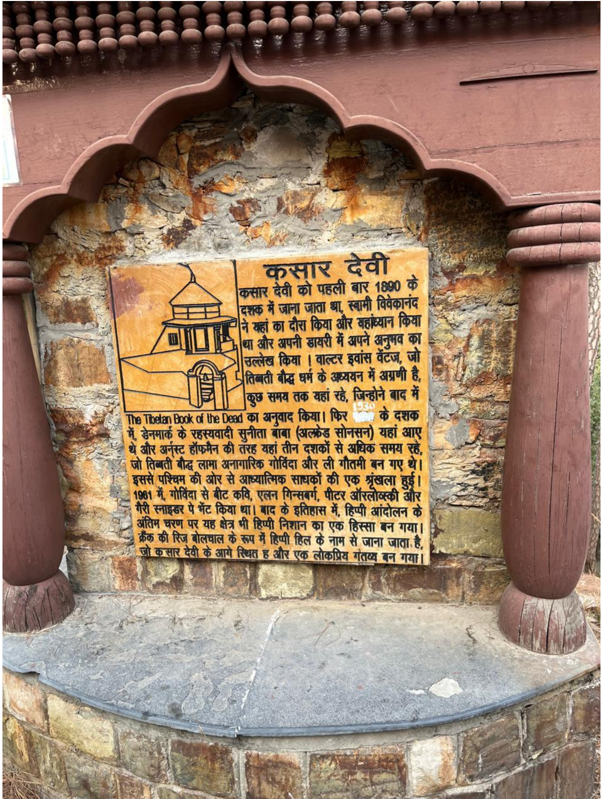
Kasar Devi temple