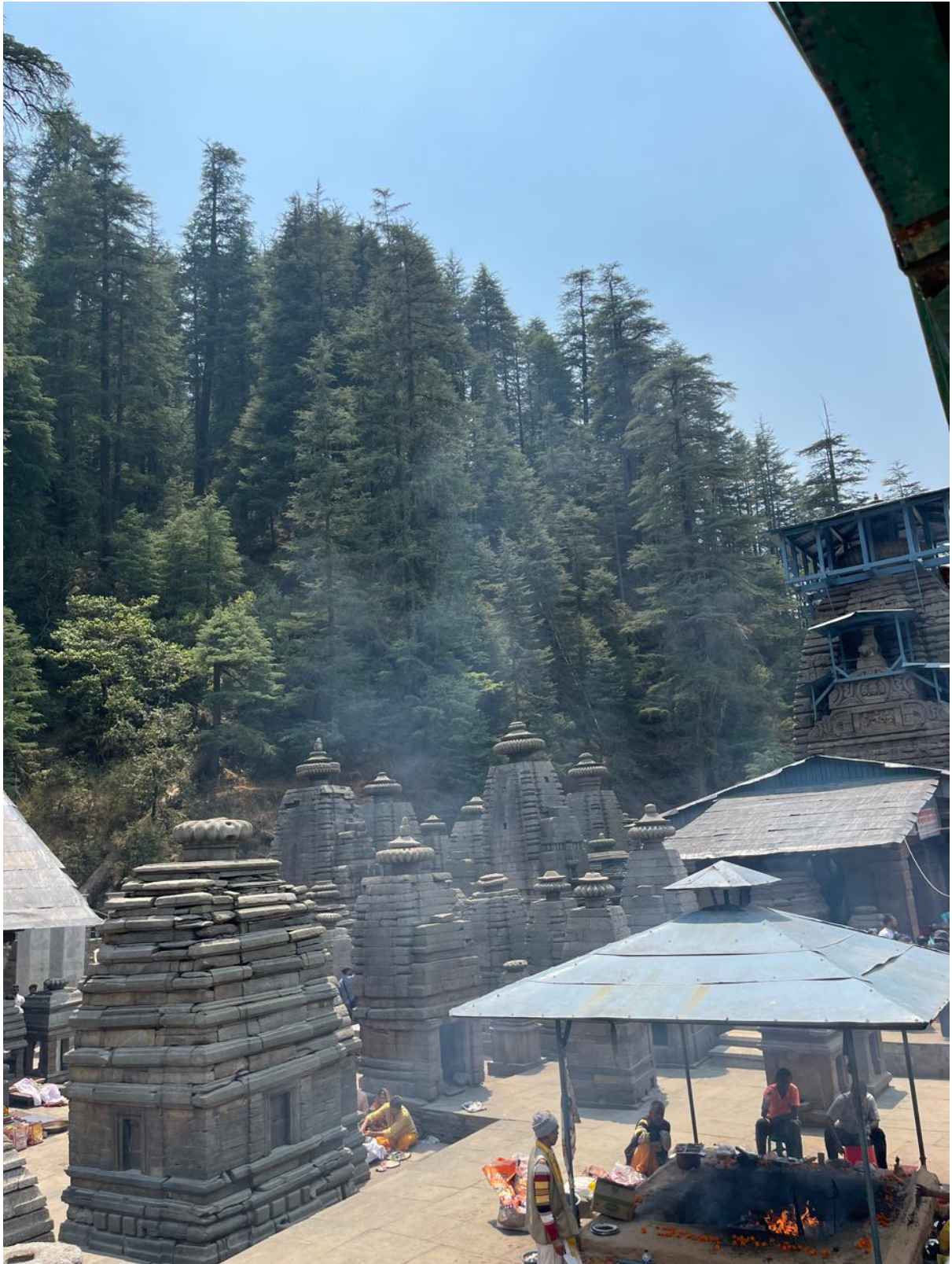
Ancient Group of temples at Jageswar